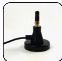
ZebraNet Internal Wireless Plus optional tethered antenna