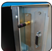
ZebraNet Internal Wireless Plus installed on a Zebra XIIIPlus printer